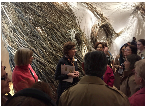
Shindig by Patrick Dougherty

On Saturday, March 19, about 40 Phi Betes took part in a tour at the newly reopened Renwick Gallery in downtown DC. Docents led our tour groups through the gallery's current exhibit, "Wonder" and provided informative commentary as the group explored the artwork. The exhibit was truly immersive, with nine large-scale, unique, and thought-provoking installations. Spectators inevitably marvel - or wonder - at the fascinating art before them. Our group was no exception.