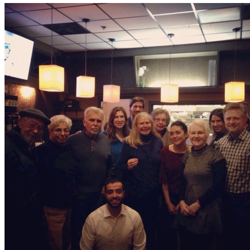
Members of the Book Club at the December Meeting

To give people a bit more time over the holidays, our December 2016 book club meeting on The Odyssey by Homer was held on Tuesday, January 3rd, 2017. PBK showed up in force with 12 members in attendance, a testament to how beloved this epic poem is, especially for those with a liberal arts background. We discussed the times and values of Homer's characters, the differences in translations, and the role of women in The Iliad vs. the Odyssey . Several members also brought in books for our newly-instituted book swap; at each meeting, members looking to clean out their personal libraries are encouraged to bring in books to see if we can find them new homes.