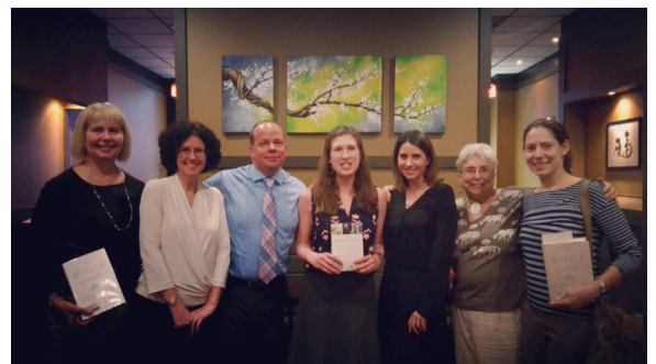
From our May meeting!

On Wednesday, May 31, seven Book Club members met at Nagomi Izakaya to discuss The White Road, Journey into an Obsession by Edmund de Waal. This nonfiction work traces the historical progression of porcelain-making from China to Saxony and England, detailing the shift from exclusive imperial and monarchical collections to mass production during the Industrial Revolution. We discussed the author's deft integration of primary source accounts, his own tactile experiences working as a porcelain artist, and a keen sense of historical symbolism and interdependence to render this story accessible to diverse audiences. Here is porcelain not only as collection but as