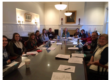
From our January Board Meeting

Meetings of the DC PBK Executive Board are open to all members in good standing. The next meeting will take place on Saturday, April TBD from 2:00-5:00 p.m. at the PBK Society headquarters, 1606 New Hampshire Avenue, NW (just two blocks from the Dupont Circle Metro's Q Street exit).