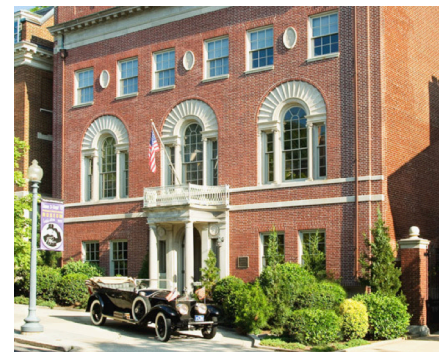
Woodrow Wilson House

Cost: The game night fee is $15 each and includes two drinks (beer, wine, soda).