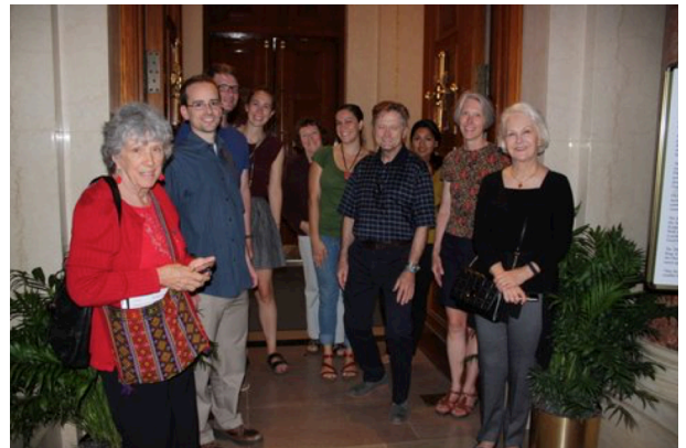
Our tour began at the Founder's Door

An hour-long tour was far too short to really grasp all the Shrine's art and history, but you can go back at any time and wander around to get a fuller appreciation of its offerings—and it's always free.