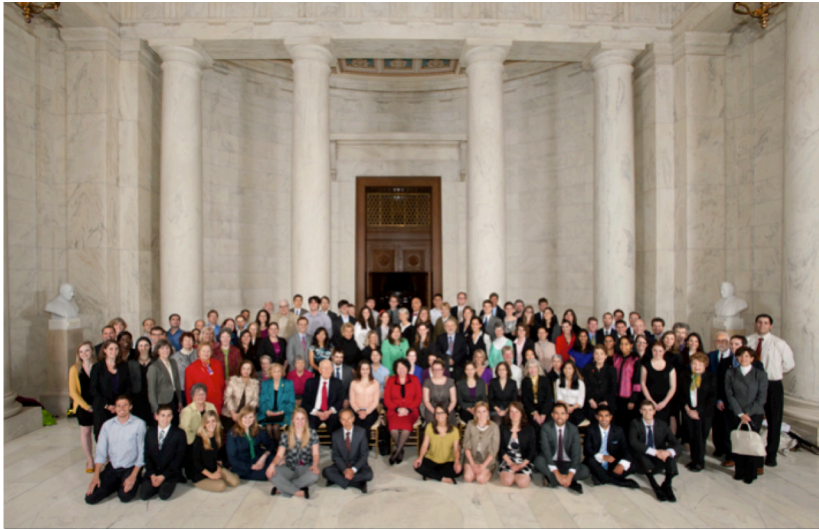
Supreme Court Assoc. Justice Sotomayor speaks to D.C. PBK

foreign oil and international troop presence in the Middle East at the Annual Business Meeting in 2011.